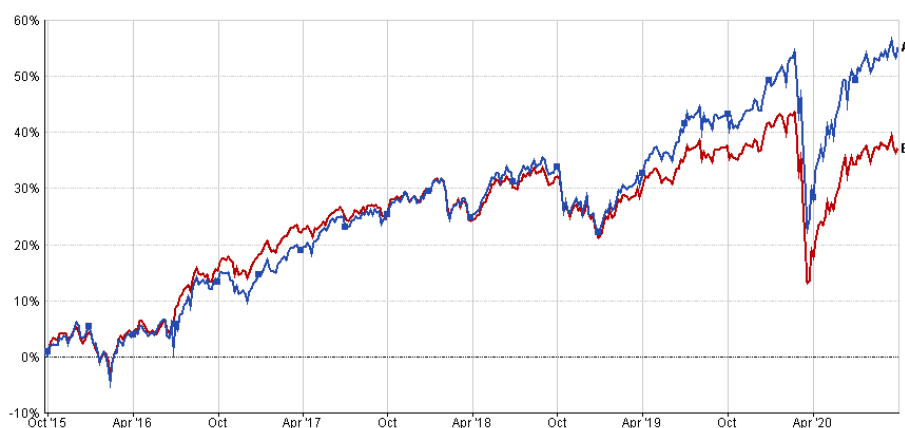
A - ***IMS Ethical (November 2011) 01/07/2020 TR in GB [55.37%] B - UT Mixed Investment 40-85% Shares Retail TR in GB [37.16%]

30/09/2015 - 30/09/2020 Data from FE fundinfo2020