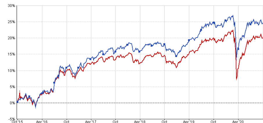
A - ***IMS Defensive Income (July 2010) 01/07/2020 TR in GB [24.65%] B - UT Mixed Investment 0-35% Shares Retail TR in GB [20.07%]

30/09/2015 - 30/09/2020 Data from FE.fundinfo2020