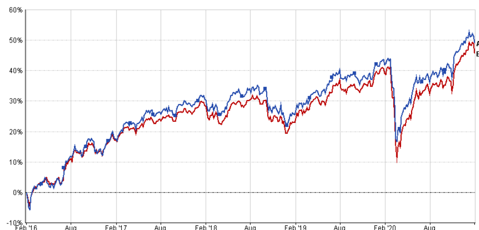
A - ***IMS Balanced (July 2010) 01/10/2020 TR in GB [49.01%] B - UT Mixed Investment 40-85% Shares Retail TR in GB [45.72%]